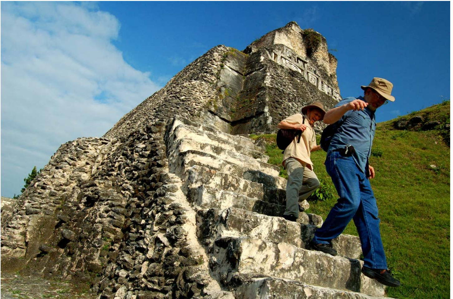
DSC 6354: The archaeological site at Xunantínich, located near Benque, Belize, are among the most photographed in the country.

100 Museum Way, Nanaimo, BC, V9R 5J8 TELEPHONE 250 753.1821 info@nanaimomuseum.ca www.nanaimomuseum.ca