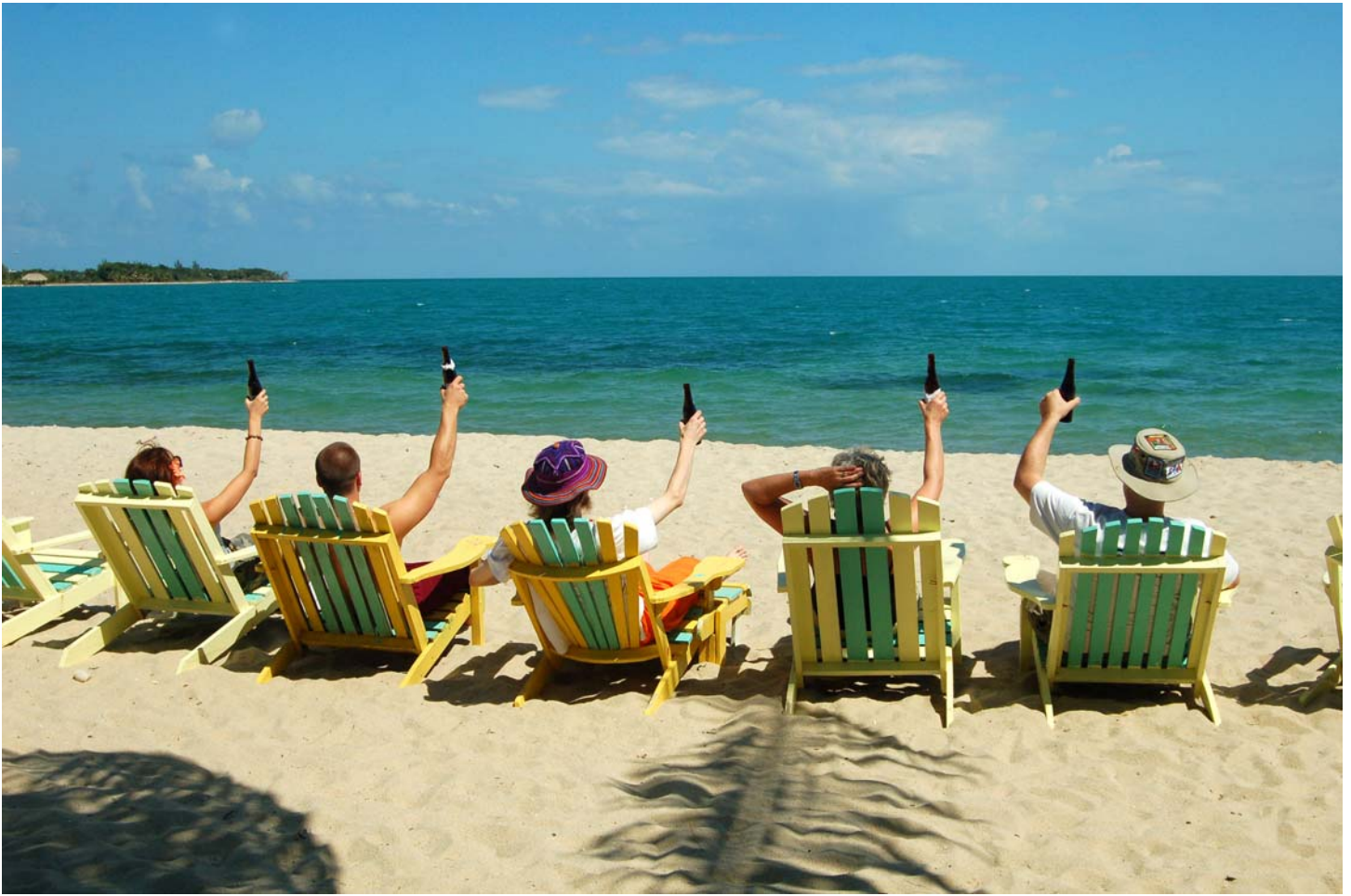
DSC: 3100: The Better in Belize team that drove from BC to Central America celebrate their arrival on the beach in Placencia along the caribbean coast.