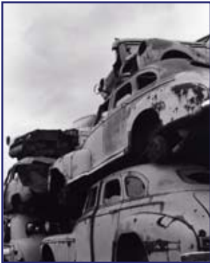
The Gorosh Pile, Nanaimo, BC